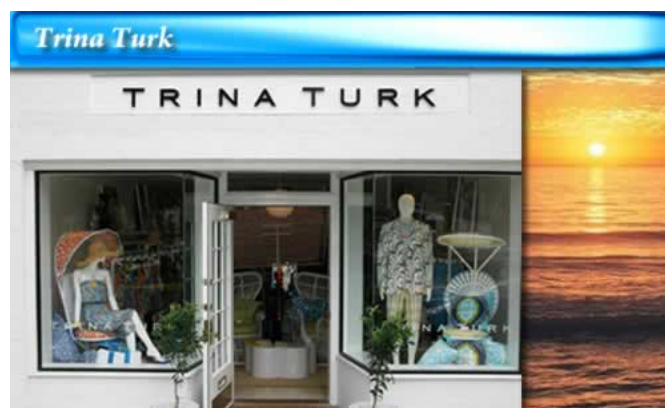
Trina Turk 79 Main Street East Hampton This is Turk's second store in the area.