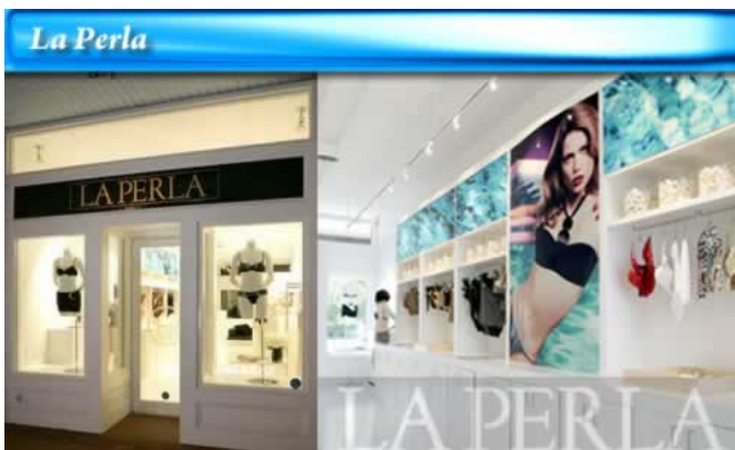
La Perla 66 Newtown Lane East Hampton The headquarters for exceptional lingerie and swimwear.