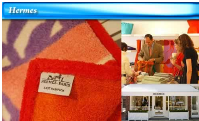
Hermes 63 Main Street East Hampton Looking for the ultimate in luxury beach towels, scarves and accessories? This is the place.