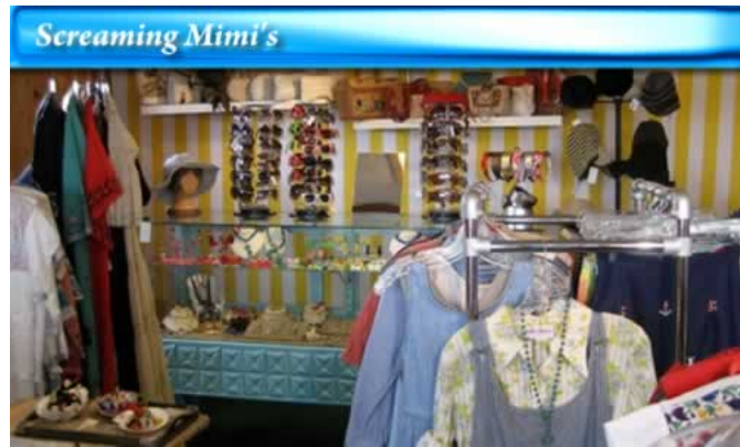
Screaming Mimi's 662 Montauk Highway Montauk Back again this summer with its combination of vintage and street chic.