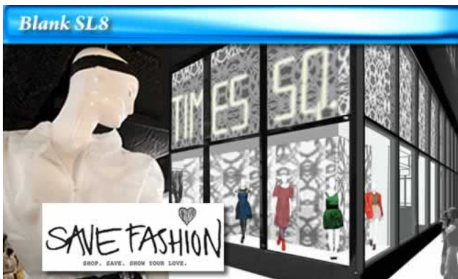
Blank SL8 Port Authority Bus Terminal, 41st Street and Eighth Avenue Part of an agreement with the Fashion Center business improvement district and the Times Square Alliance, this space is home to different retailers for a month or two at a time. It changes regularly, so just keep checking.

Remember, the key to these stores is that they're TEMPORARY - the Hamptons units for the summer season, and some for just a few days in New York. Look at your local papers and websites to find some great deals.