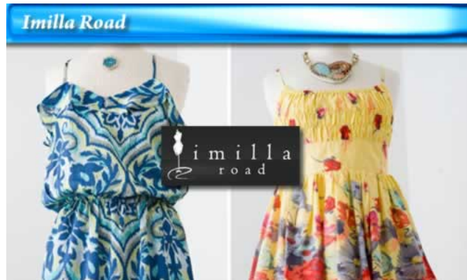
Imilla Road 29 Orchard Street Imilla Road will launch a number of pop-ups featuring affordable apparel and accessories around the city this summer.