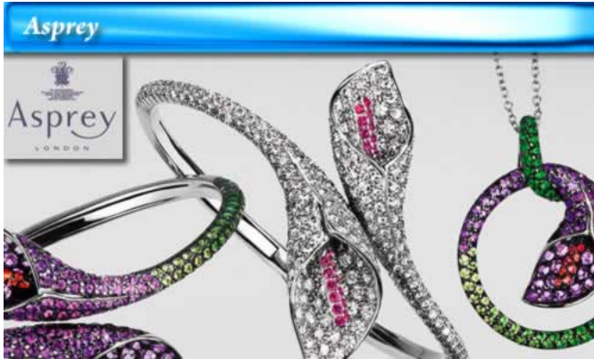
Asprey 45 Main Street Southampton You'll think you're in a walled English garden here, but this is a shop bedecked with sterling silver, crystal, china and leather goods.