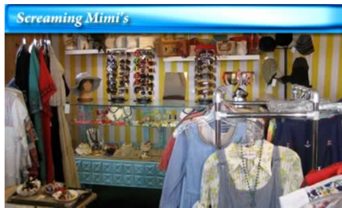
Screaming Mimi's 662 Montauk Highway Montauk Back again this summer with its combination of vintage and street chic.