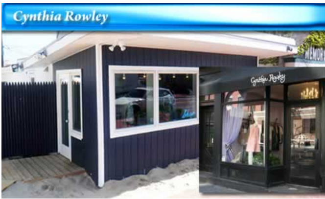
Cynthia Rowley 696 Montauk Highway Montauk Simply titled "Shop" and scheduled to remain open through October, this boutique showcases Rowley's beach and resort wear.