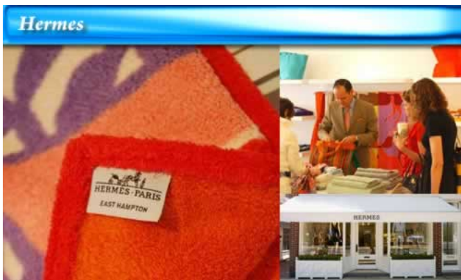
Hermes 63 Main Street East Hampton Looking for the ultimate in luxury beach towels, scarves and accessories? This is the place.