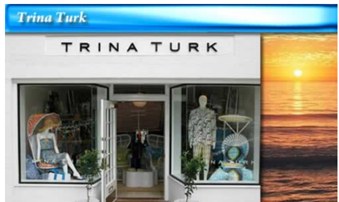
Trina Turk 79 Main Street East Hampton This is Turk's second store in the area.